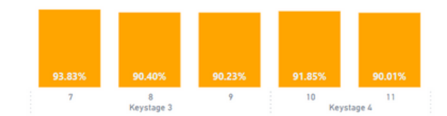
% Attendance YTD