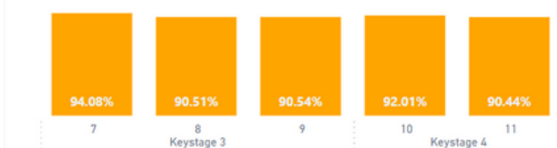
% Attendance YTD