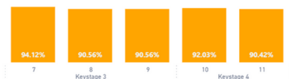
% Attendance YTD